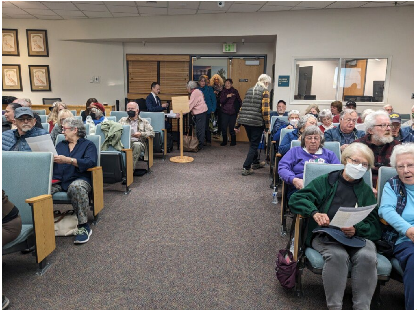
CPUC hearing in Mendocino County Board of Supervisors – Feb 22, 2024